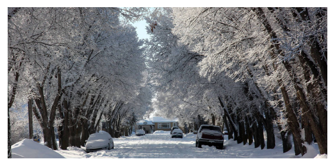
Maple Creek's urban forest is breathtakingly beautiful, no matter the season!

For the last few years, workshops have been held to train residents on proper pruning techniques as part of the spring CiB Workshops.