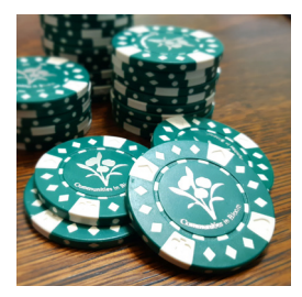
The Maple Creek Visitor Centre distributes green Landfill tokens.

The Maple Creek Visitor Centre distributes green CiB tokens that residents can give to the Landfill operators in exchange for compost.