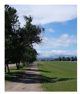
The Community Walking trail passes through naturalized areas.

The trail follows the natural contours of the landscape to allow users to feel as though they are part of their surroundings, and passes through naturalized areas featuring wildflowers and native shrubs.