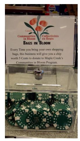
Co-op donates 5 cents to CiB for every reusable bag.

Due to COVID-19, the amount of reusable grocery bags brought to the Co-op Food Store has been reduced. CiB, however, still encourages residents to use their reusable bags providing they follow proper COVID-19 guidelines for packing while at the Food Store.