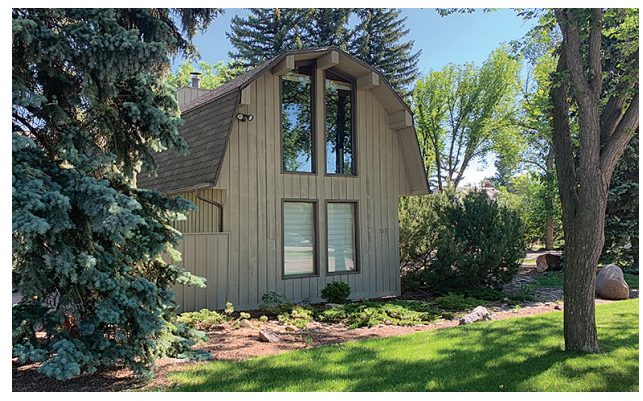
#317 Walsh Street was chosen as the first Yard of the Week for the 2020 season for its unique features and neat appearance.

In 2014, the CiB committee implemented 'Yard of the Week' in order to encourage the whole community to beautify their properties. Past winners are invited to select a yard as 'Yard of the Week' and the winner receives a sign designating their yard as 'Yard of the Week.' Winners also receive recognition in the weekly local newspaper, CiB social media, and the annual CiB Soirée.