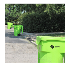
Each household has a green Emterra single-stream recycle bin.

The Eco Centre for recyclable oil has recently been relocated to Pacific Avenue.