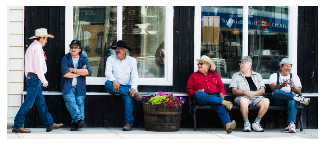
An uniting element in our downtown core is the usage of the colour black with inspiration taken from the distinctive black cornice along the top of the Post Office.

Special signage for the Heritage District includes a number of murals depicting elements of Western life, along with the heritage silhouettes that appear on waste receptacles, archways, advertising signs, and town publications are intended to welcome visitors to enter the Old Cowtown and experience the history that lives here. Maple Creek won the distinction of "Canada's Greatest Western Town" in 2014, beating out over 30 other communities in an on-line competition.