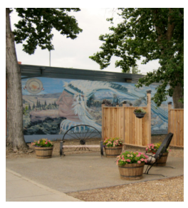
The Credit Union Pocket Park is a cute little seating area.

There have been surveys of the community's trees in an attempt to find the oldest living tree in Maple Creek. This is being done primarily by trunk diameter, as records of original plantings are scarce.