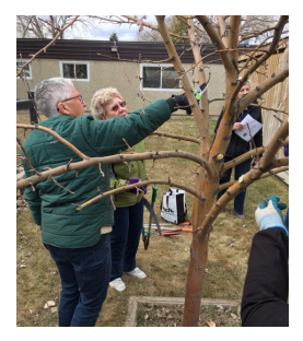
The CiB Tree Pruning Workshop had a great turnout!