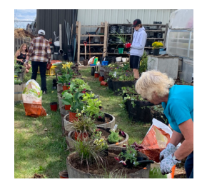
Volunteers help plant our whiskey barrels for the 2020 season.

It is hoped that this will foster community pride in the students and an interest in the environment around them, in planting or gardening, and in the goals and ideas CiB promotes.