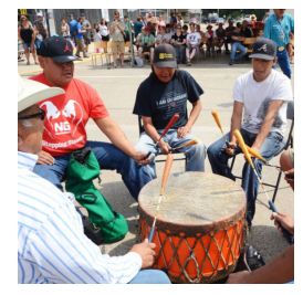
Nekaneet Band Members drumming during the 2019 Heritage Festival.

In 2016, the Town of Maple Creek renamed a street "Nekaneet Drive" to commemorate the longstanding relationship between the Town of Maple Creek and Nekaneet First Nations.