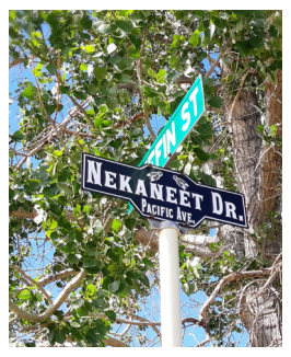
Nekaneet Drive runs from Pacific Avenue to Sydney Street and East towards the water tower.