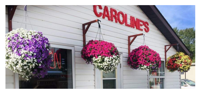
Caroline's Drive-In was the first Business of the Month for the 2020 season!

The winners receive a sticker for the window naming them 'Business of the Month.' They are also recognized in our local newspaper, on CiB social media, and the annual CiB Soirée along with our Yard of the Week winners, CiB Committee Members and other CiB volunteers.