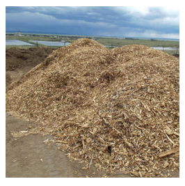
Large mulch pile out at the Landfill.

The Maple Creek Visitor Centre distributes green CiB tokens that residents can give to the Landfill operators in exchange for mulch.