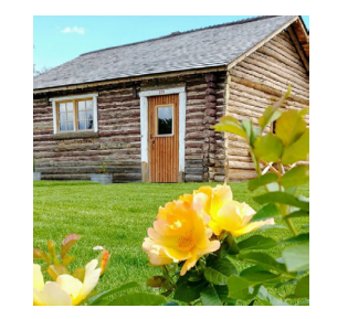
Early settler-introduced plants include grasses, shrubs, medicinal, and other useful spices.

The Oldtimers' Museum has expanded their facility with a new log building, complete with landscaping that includes sections of native and early settlerintroduced plants.