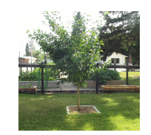
One seasonal bylaw ensures grass does not exceed 6 inches.

The Town of Maple Creek's seasonal Bylaw Officer monitors properties around town to make sure they are in accordance with the Town bylaws.