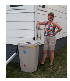
This year, 8 of the 10 rain barrels sold in the first month of the program.

Residents are asked to bring a receipt and photo of their installed rain barrel to the Visitor Centre where staff post it on CiB social media as a thank you from the Town of Maple Creek and CiB for conserving water and caring about our community and environment.