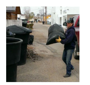
The introduction of single-stream recycling to Maple Creek has significantly diverted waste from the Landfill.

The Town of Maple Creek has a pet bylaw prohibiting pet owners from having more than two pets per household and ensures animals are not running around at large or causing harm to residents.