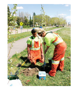
Parks and Rec crew planting a boulevard tree at its new home.

They also maintain our downtown area making sure weeds on the sidewalks are pulled, downtown hanging baskets are watered, garbage receptacles are emptied, downtown furniture is in good condition, and painting curb lines.