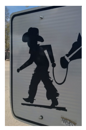
One of Maple Creek's unique signs at a downtown cross walk.

The committee is comprised of representatives from the Town of Maple Creek, the Rural Municipality of Maple Creek, the Maple Creek Chamber of Commerce, the Jasper Cultural and Historical Centre, the S.W. Saskatchewan Oldtimers' Museum, heritage property owners, local historians, building contractors, tourism operators, and educators.