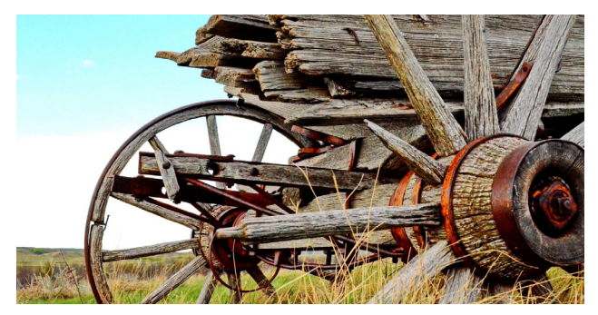
The winning photo from the CiB 2017 Photography Contest.

We received over 100 photos for the 2019 contest. Residents voted for their favorites during the month of August 2019 at the Maple Creek Heritage Festival. Winners are recognized at the annual CiB Soirée.