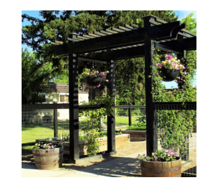
Due to COVID-19, there has been a noticeable increase of interest for gardening.

This summer, CiB is planning to host a Garden Tour with emphasis on vegetable gardens. This idea was inspired by the increased interest in gardening this season due to COVID-19. Physical distancing restrictions will be followed at all times during the 2020 Garden Tour.