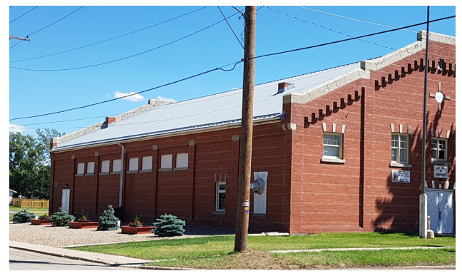
CiB installed a Colorado Blue Spruce 'Living Fence' at the Maple Creek Armoury, a designated heritage building. Work has progresses with the addition of raised flower beds.

CiB has installed a Colorado Blue Spruce 'Living Fence' at the Armoury, a designated heritage building. Brick watering wells have been planted around the trees. Gravel has been added and work has progressed with the installation of raised flower beds.